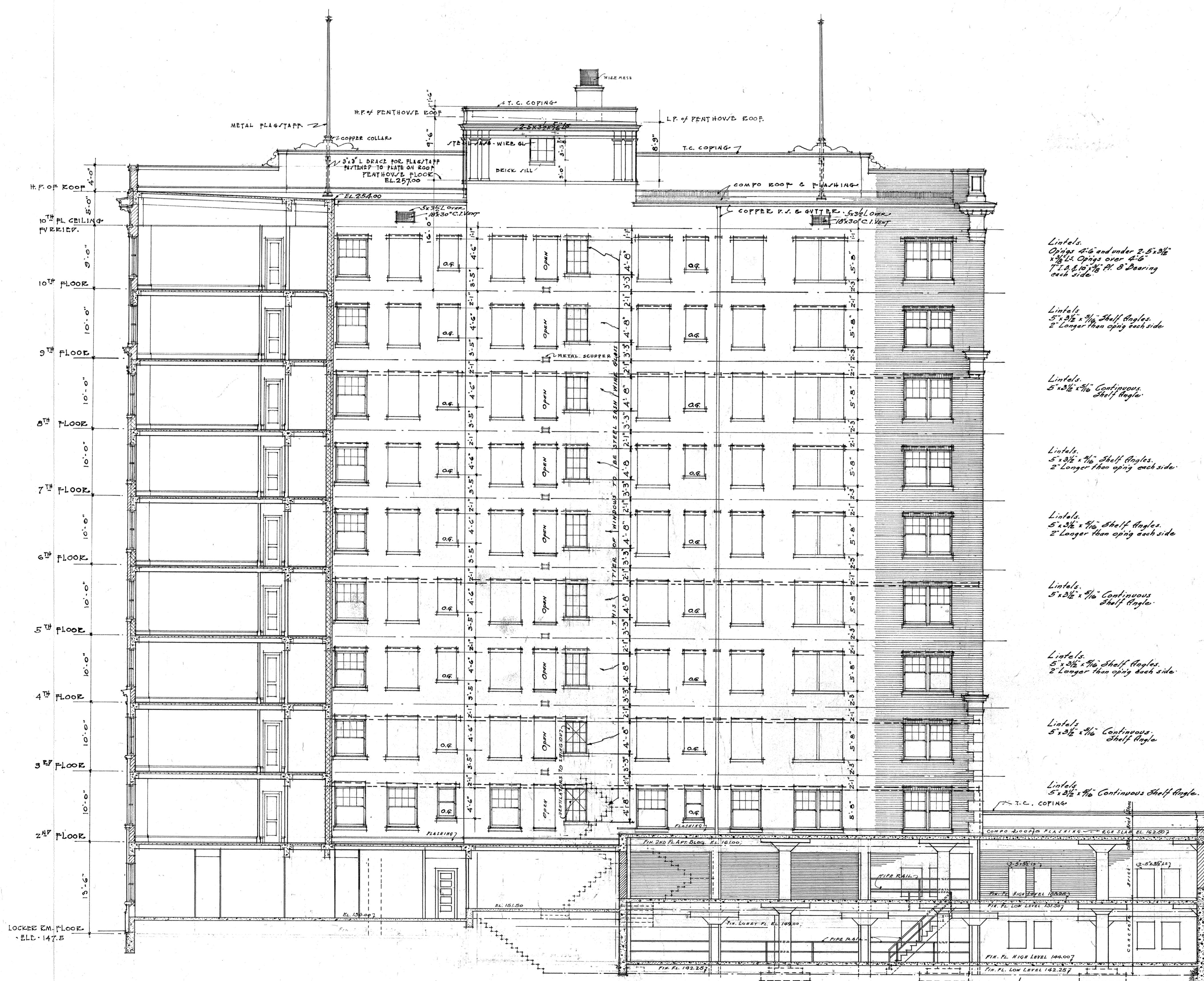
• COURT ELEVATION • LOOKING EAST • • SCALE • 1/8" = 1'-0" •

NOTE: All figures & memoranda to be checked by Contractor and errors referred to Architect for correction.